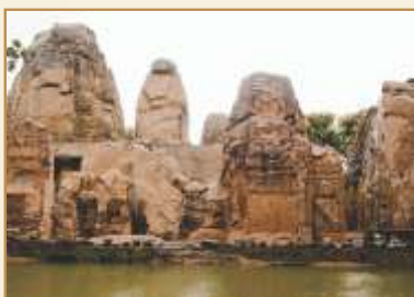
The Masrur Temples