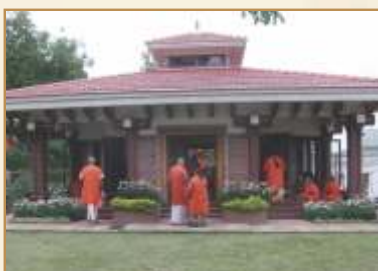
Chinmaya Tapovan Trust (Ashram)