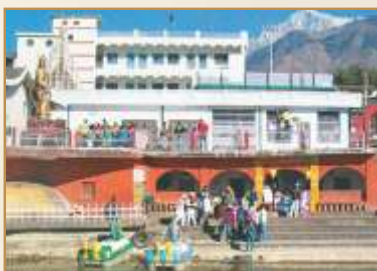
Chamunda Devi Temple