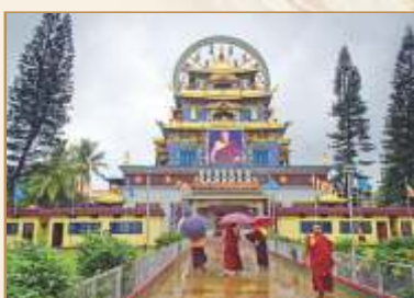
Buddhist monument, MacLeodganj