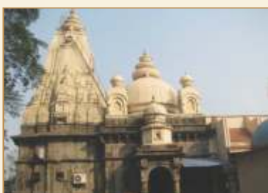
Chinmaya Tapovan Trust (Ashram)